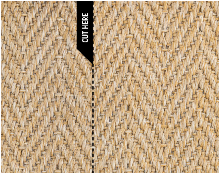
Figure 1: Cut between Paired loops

⚠ When cutting seams, be mindful of the quality of material you are working with. Always use sharp blades. Do not use hook blades, as they will cause excessive and unnecessary fraying